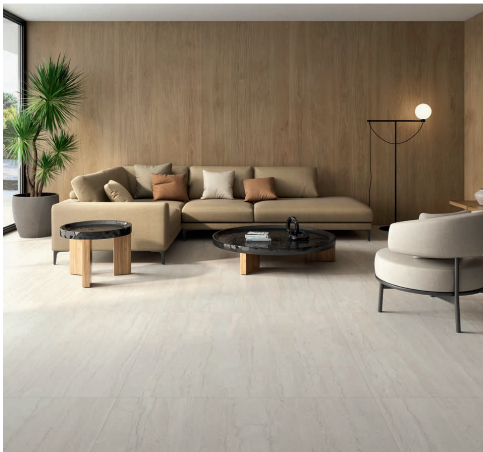
Rvto. / Wall / Rvym: Kalon Roble 120x280 Pvto. / Floor / Sol: Dorset Marfil 120x120