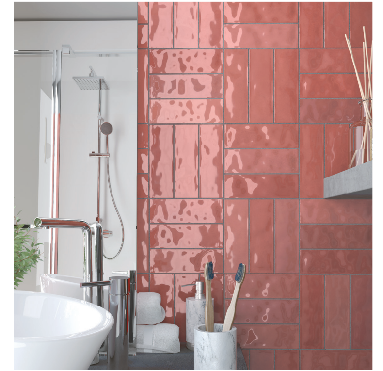
Nolita Burdeos 6,5x20cm_2,6"x7,9"