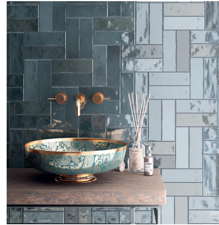
Nolita Marine 6,5x20cm_2,6"x7,9"