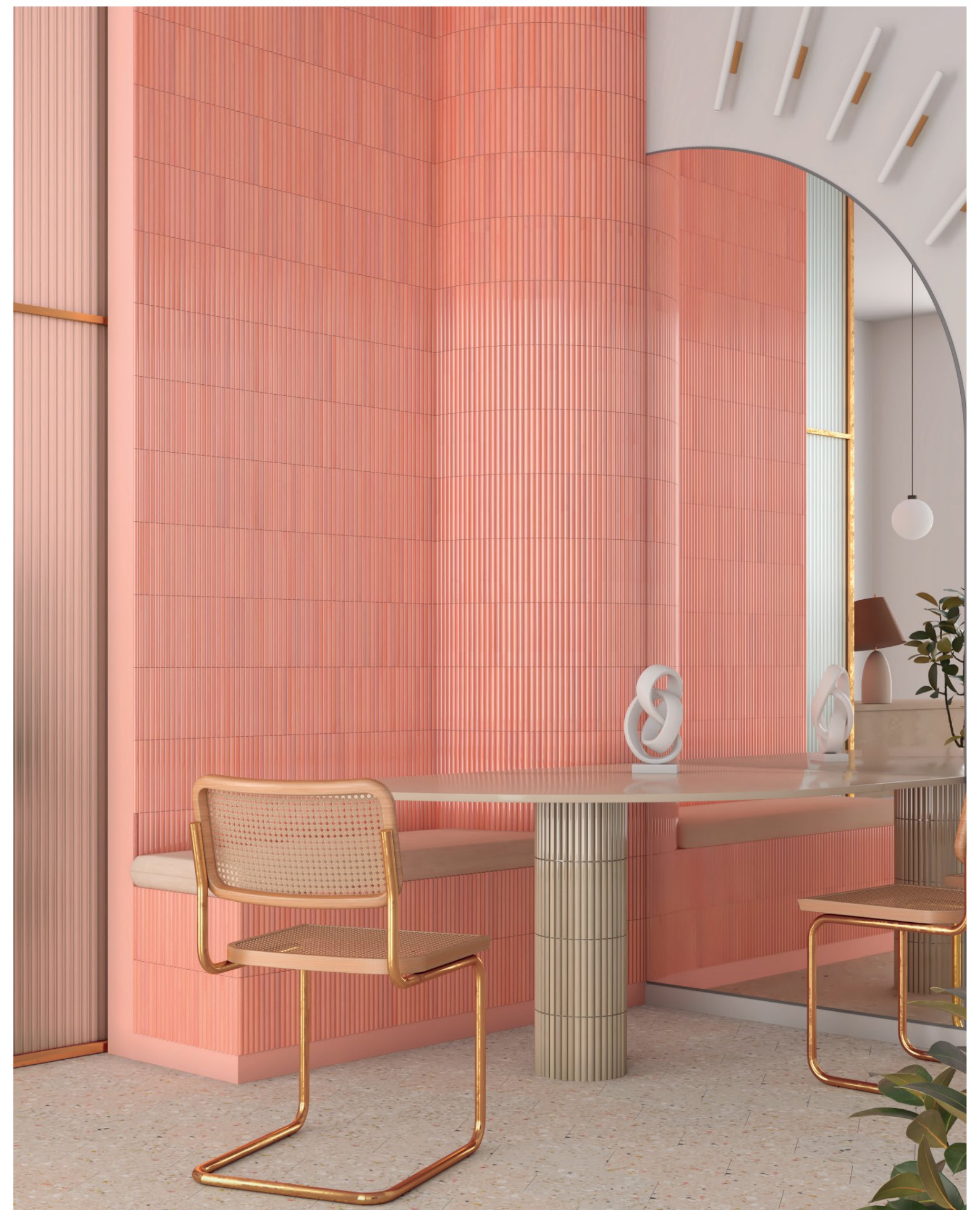
Nolita Jolly Rosa & Beige 1,5x20cm_0,6"x7,9", Arousa Blanco 25,8x29cm_10,2"x11,4"