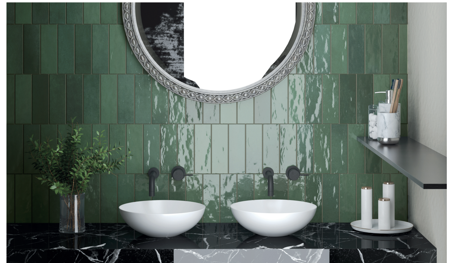
Nolita Verde 6,5x20cm_2,6"x7,9"