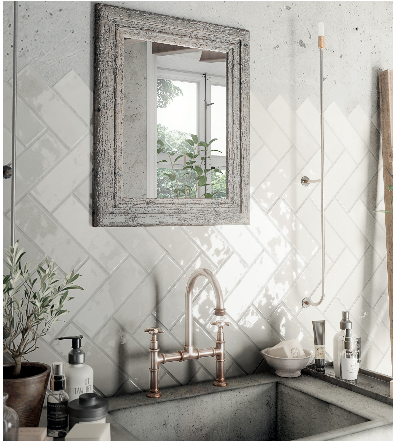
Nolita Blanco 6,5x20cm_2,6"x7,9"