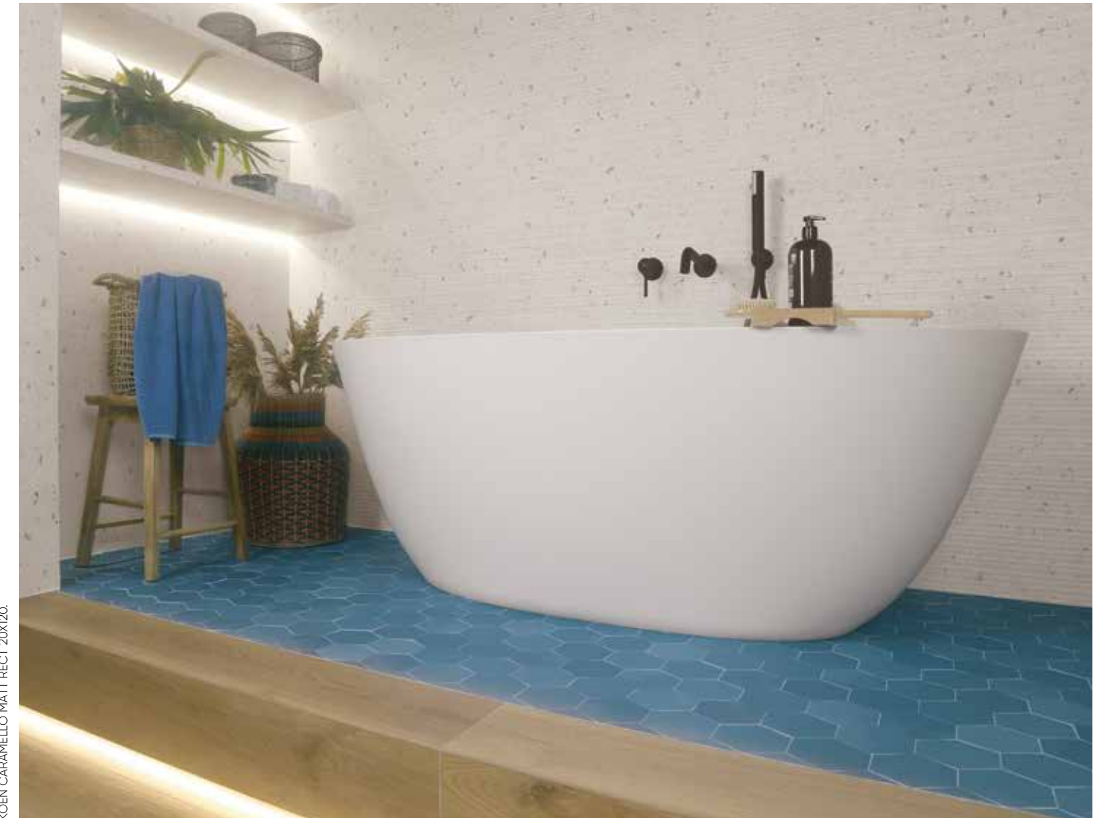
RE-USE WHITE RECT. 40X120, MOBIUS WHITE 40X120, HEXA OFF DARK BLUE MATT TOXIT, KOEN CARAMELLO MATT RECT 20X120.