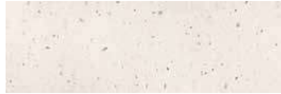
RE-USE WHITE RECT. 40 X 120 / 16" X 48" N51/M