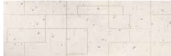
GARY WHITE RECT. 40 X 120 / 16" X 48" R32/M