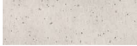
RE-USE GREY RECT. 40 X 120 / 16" X 48" N51/M