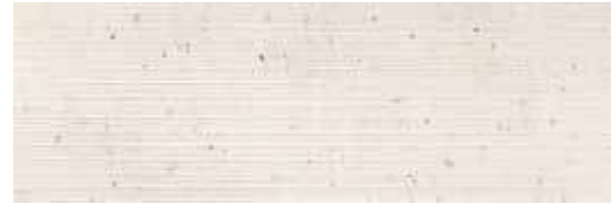
MOBIUS WHITE RECT. 40 X 120 / 16" X 48" R32/M