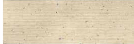
MOBIUS NATURAL RECT. 40 X 120 / 16" X 48" R32/M