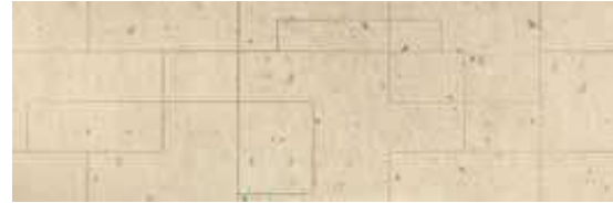
GARY NATURAL RECT. 40 X 120 / 16" X 48" R32/M