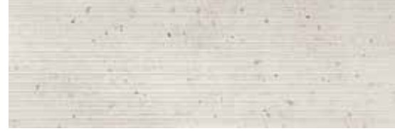
MOBIUS GREY RECT. 40 X 120 / 16" X 48" R32/M