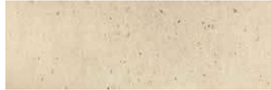
RE-USE NATURAL RECT. 40 X 120 / 16" X 48" N51/M