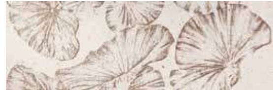
DECOR CICKLA WHITE 40 X 120 / 16" X 48" K82/P