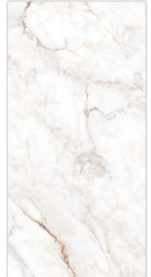
1200x600x8 mm | Full lapatto