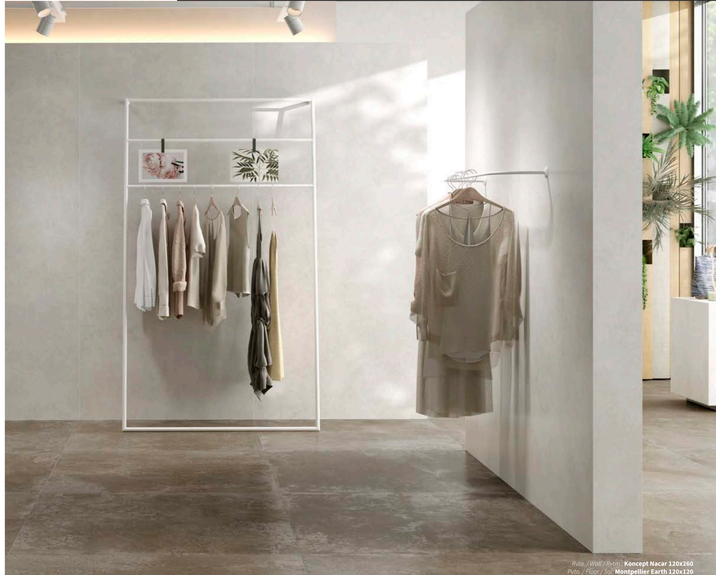
Rvto. / Wall / Rvtm.: Konzept Nacar 120x260 Pvto. / Floor / Sol: Montpellier Earth 120x120