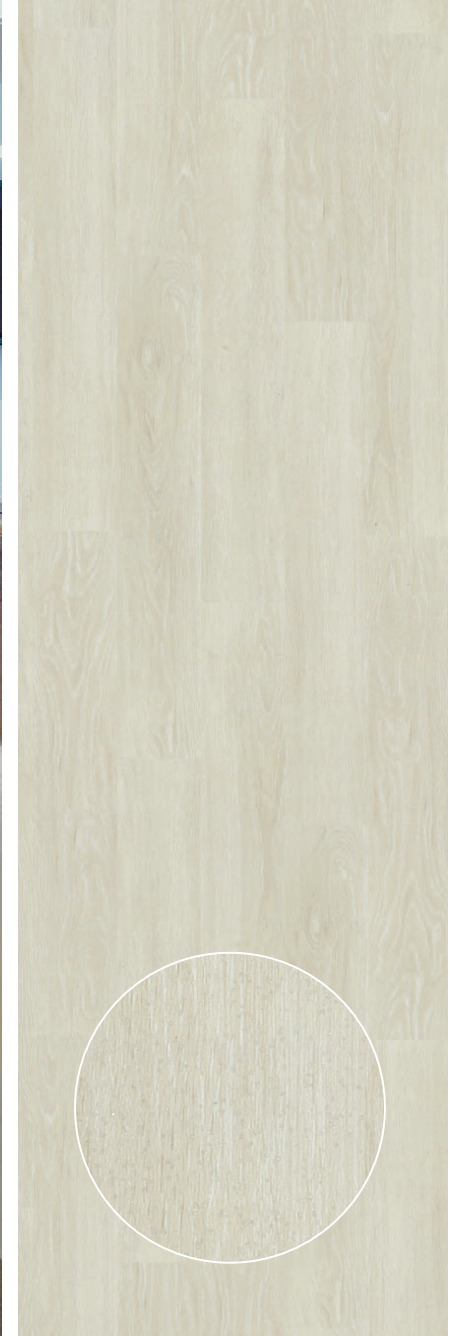
Magnified area of product to show an almost invisible slip resistance