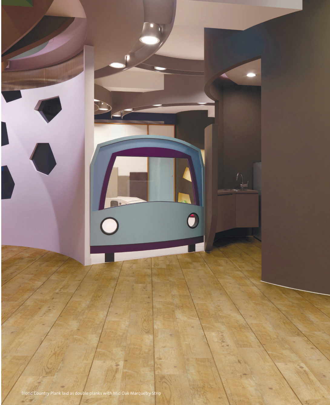
Blond Country Plank laid as double planks with Mid Oak Marquetry Strip