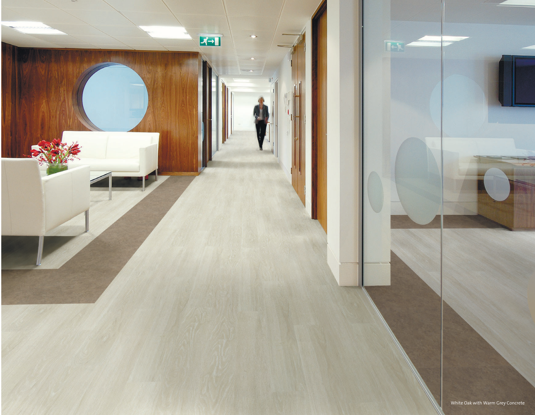
White Oak with Warm Grey Concrete