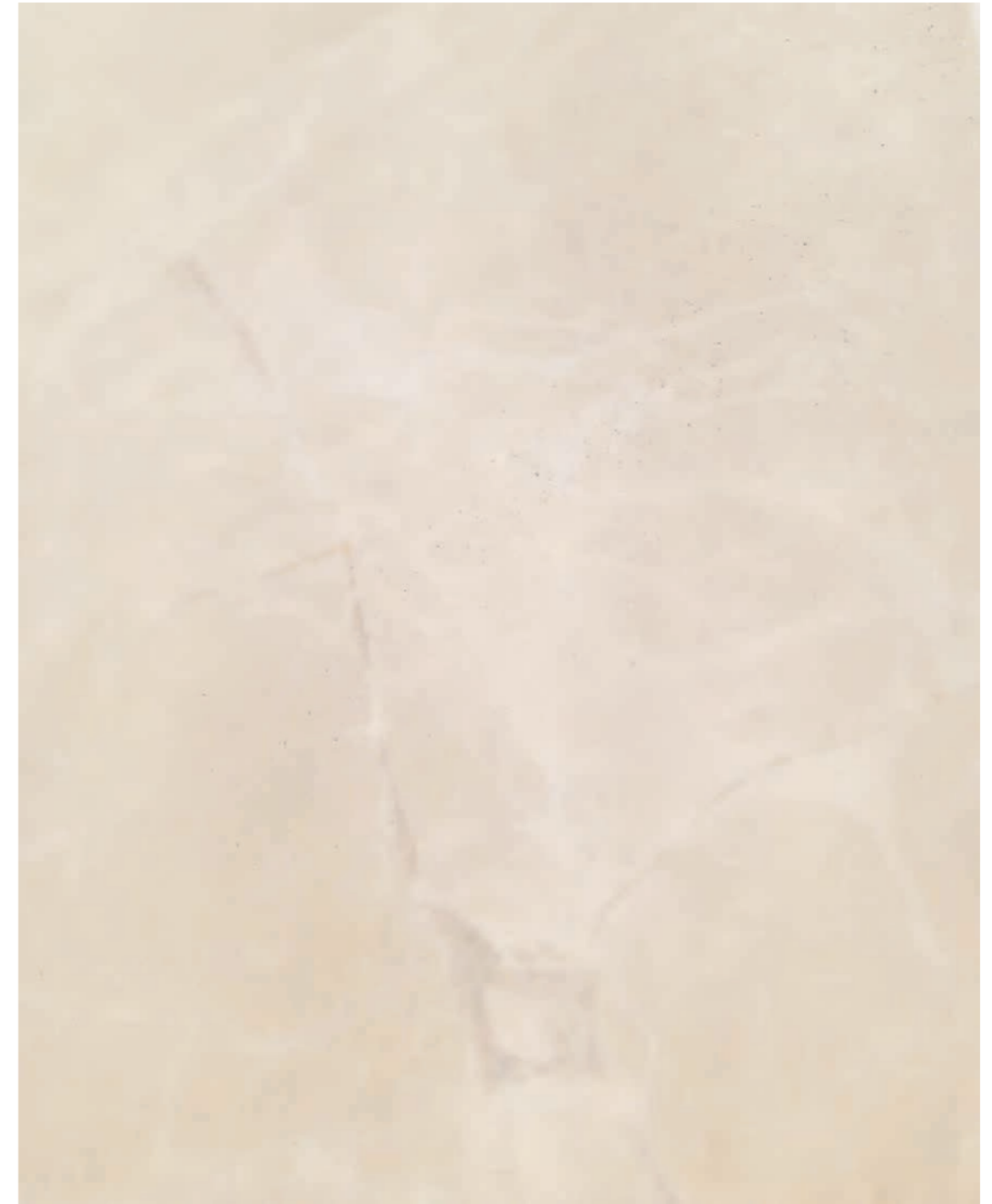
EDEN SAND PS