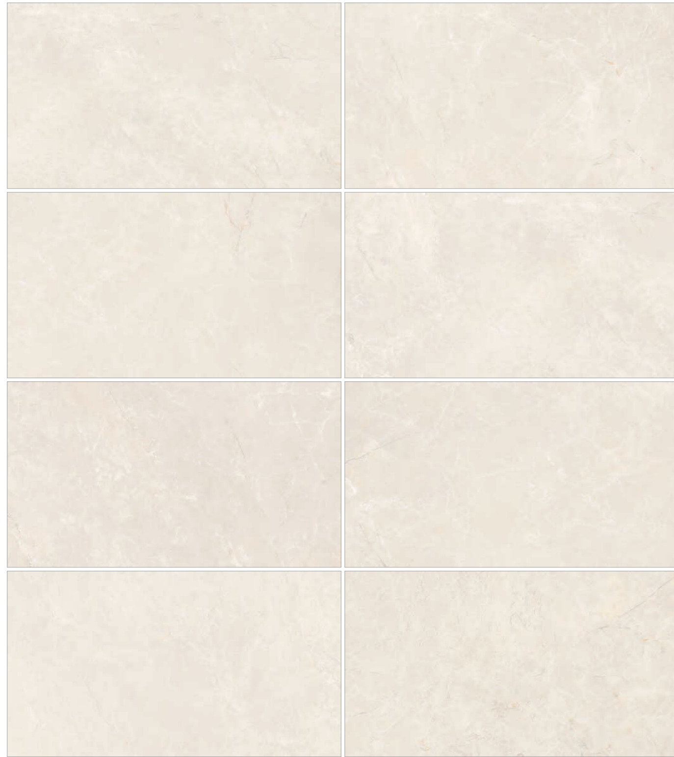
PATTERNS VARIETY VARIEDAD GRÁFICA EDEN SAND 100x180 cm FORMAT EDEN SAND FORMATO 100x180 cm