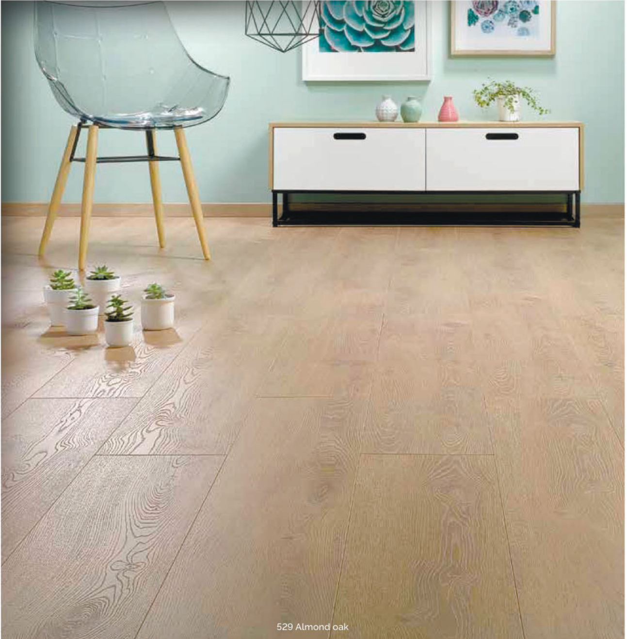
529 Almond oak

AN IN-REGISTERED FINISH AND 4 BEVELS GIVE A HIGHLY REALISTIC PARQUET EFFECT