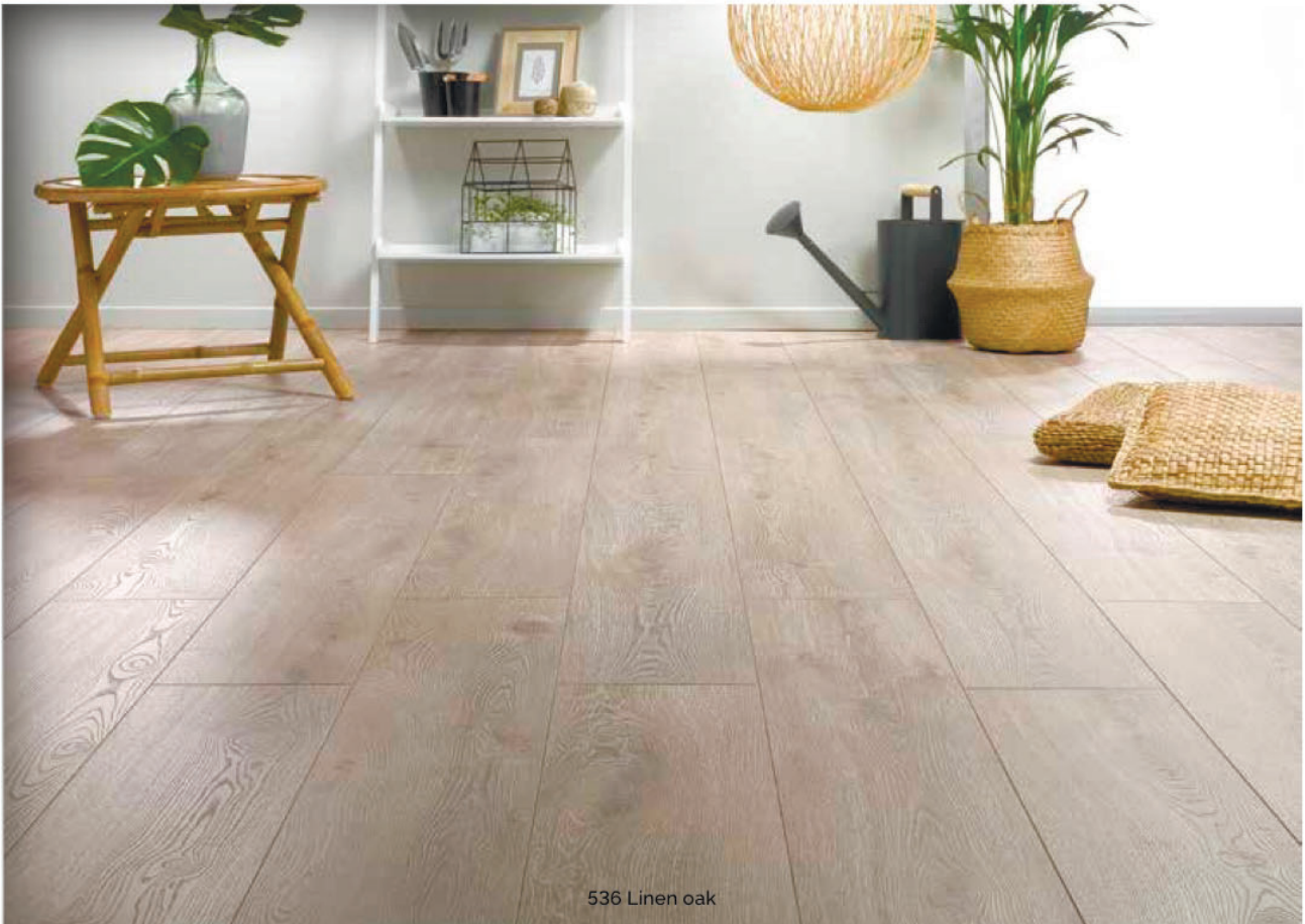
536 Linen oak