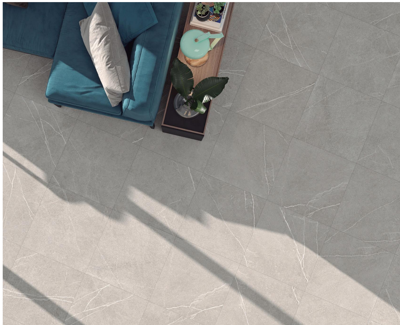
Ambiente Camden Grey Rect. 75x75

Rectified: Disponible bajo pedido. Skirting: Available on request. Mosaic: 30x30 (3x3) Disponible en todos los colores bajo pedido. Available in all colors on request.