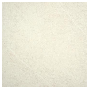
Camden Ivory Rect.