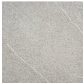
Camden Grey Rect.