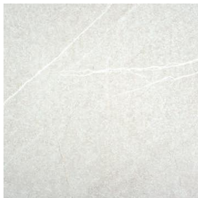
Camden White Rect.