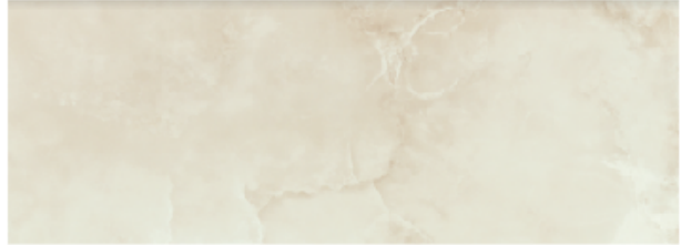
1/3 BIELY BŁĘKITY BŁĘKITY (PŁYTY 33,3x33)