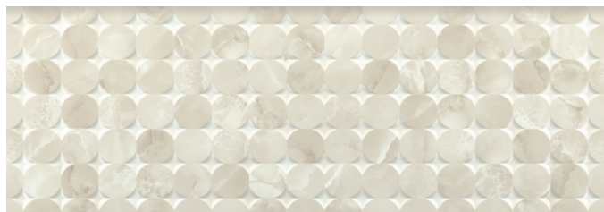
485016/P.B. BIBURY BEIGE MOSAIC BRILLO RECT/333x900x10