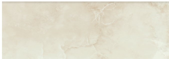
485020/P.B. BIBURY BEIGE BRILLO RECT/333x900x10