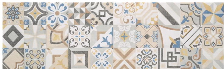
467376/DEVAN HIDRAULICO MOSAIC MATE/333x1000x10