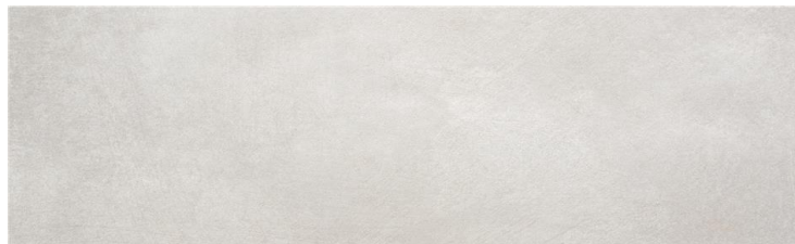
467373/DEVAN GRIS MATE/333x1000x10