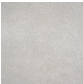
467397/G. DEVAN GRIS MATE/450x450x9,1