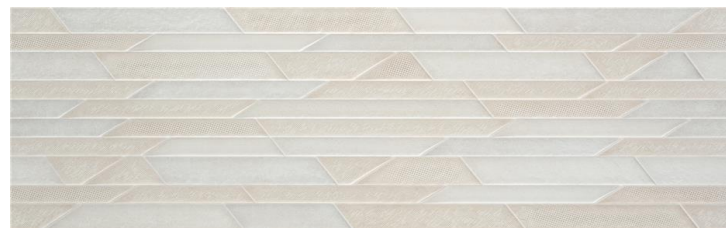
467395/DEVAN CELDAS MOSAIC MATE/333x1000x10