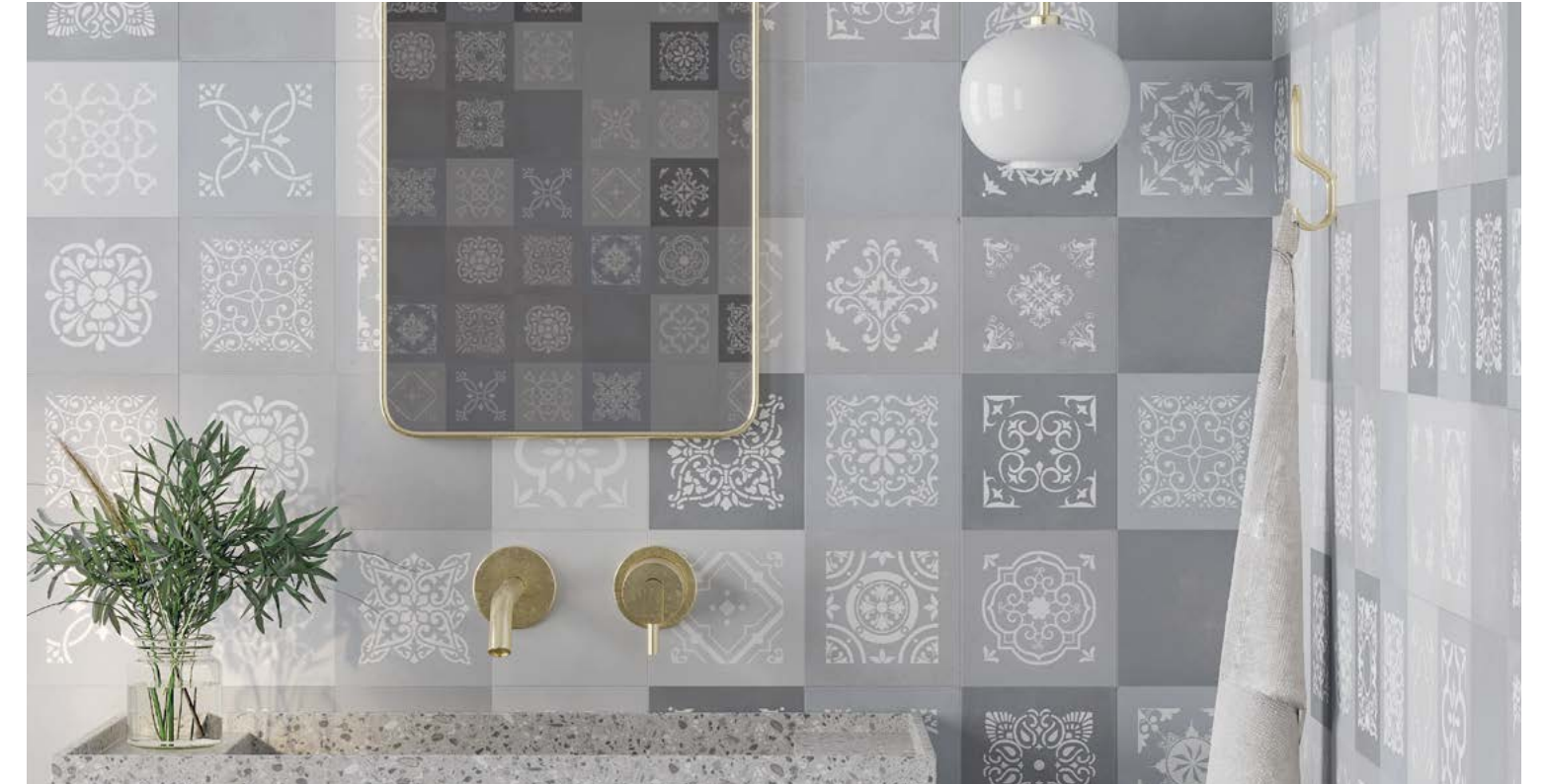
Taco Delice Grey 16,5x16,5 / 6,5"x6,5"