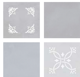
Taco GF-20305D Delice Grey 16,5x16,5 cm / 6,5"x6,5"