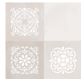
Delice Almond GF-20300D 33,15x33,15 / 13,1"x13,1"