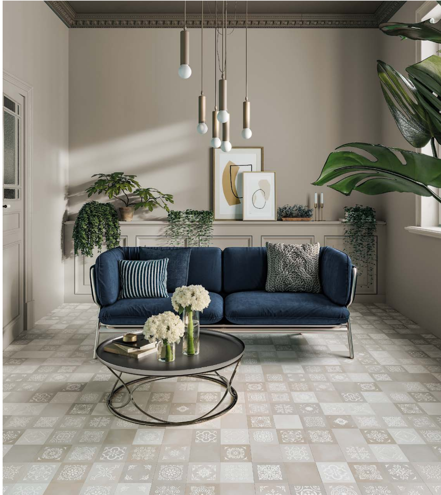
Delice Almond 33,15x33,15 / 13,1"x13,1"

33,15x33,15 cm / 13,1"x13,1" 16,5x16,5 cm / 6,5"x6,5"