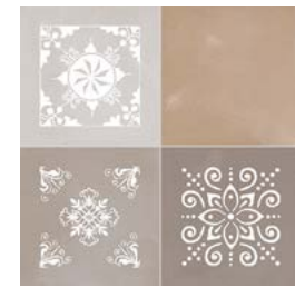
Delice Natural GF-20300D 33,15x33,15 / 13,1"x13,1"