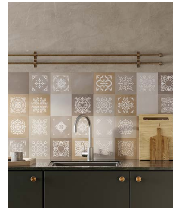
Taco Delice Natural 16,5x16,5 / 6,5"x6,5"