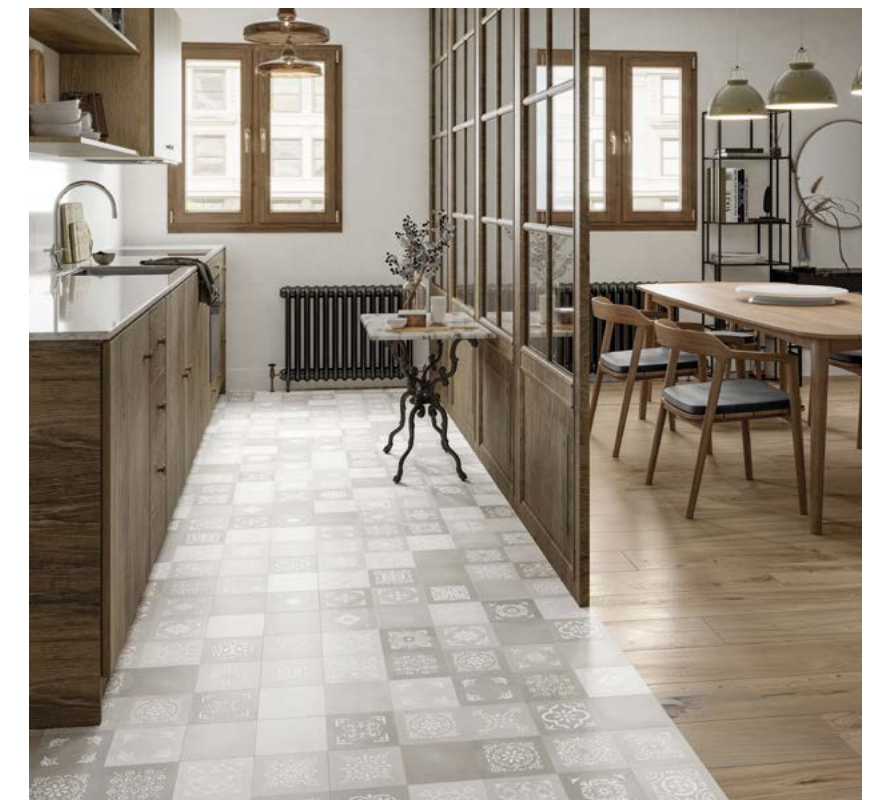
Delice Almond 33,15x33,15 / 13,1"x13,1" - Oregon Natural 20x120 / 7,9"x47,3"