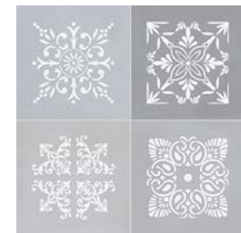
Delice Grey GF-20300D 33,15x33,15 / 13,1"x13,1"