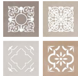
Taco GF-20305D Delice Natural 16,5x16,5 cm / 6,5"x6,5"

33,15x33,15 cm / 13,1"x13,1" 16,5x16,5 cm / 6,5"x6,5"