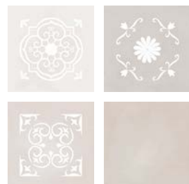
Taco GF-20305D Delice Almond 16,5x16,5 cm / 6,5"x6,5"